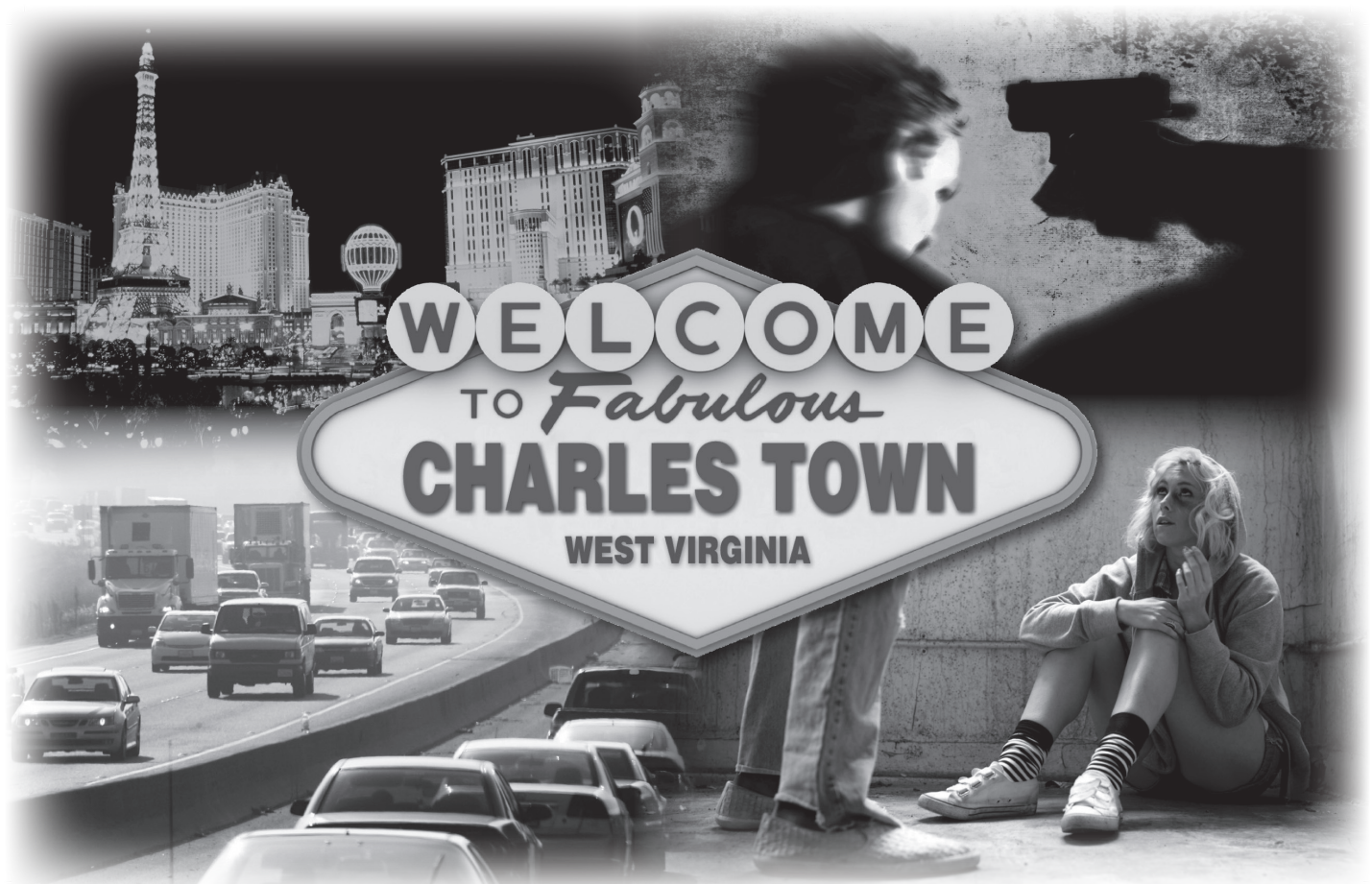
Table Games. Get the Facts, and Count the Costs...

Crime will follow table games, which will attract a different crowd than slots: prostitutes, drug dealers, con men, even organized crime.